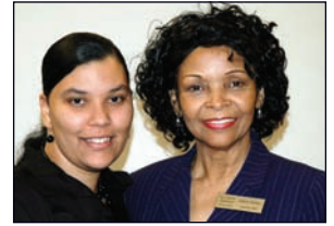
Reverend and Mrs. Zilmon E. Barr Memorial Scholarship