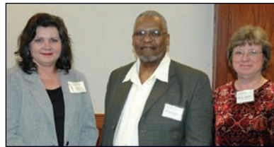
Roberta Jackson Memorial Scholarship