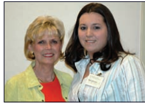
Todd Allen Scholarship