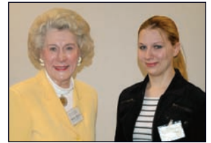
A. L. and Verneil Reed Scholarship