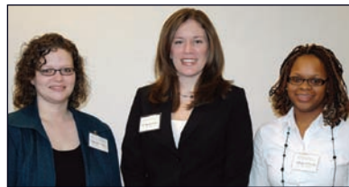
La Coterie Scholarship