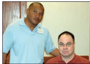
Jimmie Ladd Richardson Scholarship