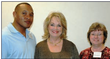
Ralph W. Sloan Memorial Scholarship