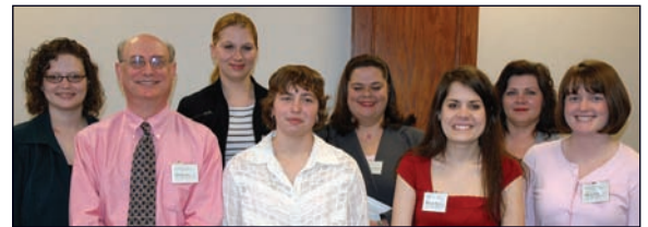
Rotary Partners in Education Scholarship