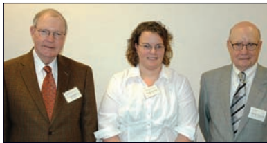
Crittenden National Bank Scholarship