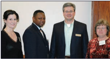
Maxine Neri Memorial Scholarship