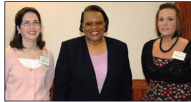
Mary Meux Toney Scholarship