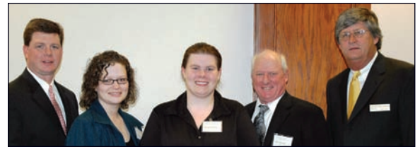
Crittenden County Farm Bureau Scholarship