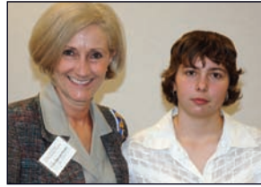
Robert Crittenden Chapter NSDAR Scholarship