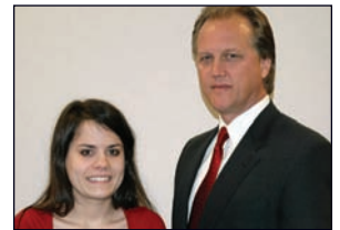
Hattie M. Kemp Memorial Scholarship