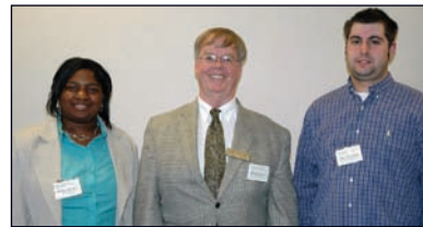
Southland Greyhound Park Employee Dependents Scholarship